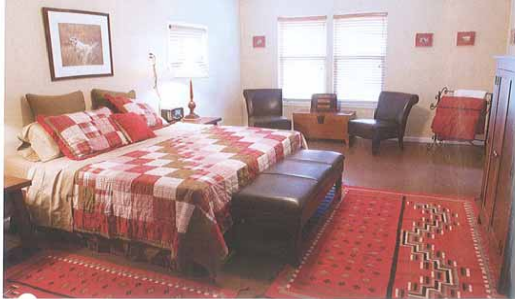
Quail hunters (and their wives) sometime prefer one of Kowiki's six private and professionally adorned bedrooms.

When you think about it ... it sounds just like a dream come true. ♦