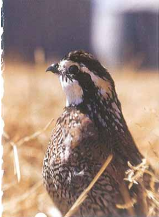
The whistle of the bobwhite remains strong on this lodge named for the Creek Indian word meaning quail.

"I dreamed that I shot an arrow from Georgia," says the 65-year-old Georgian. "That arrow landed in Texas and busted a covey of wild quail. And that's how I came up with the lodge logo."