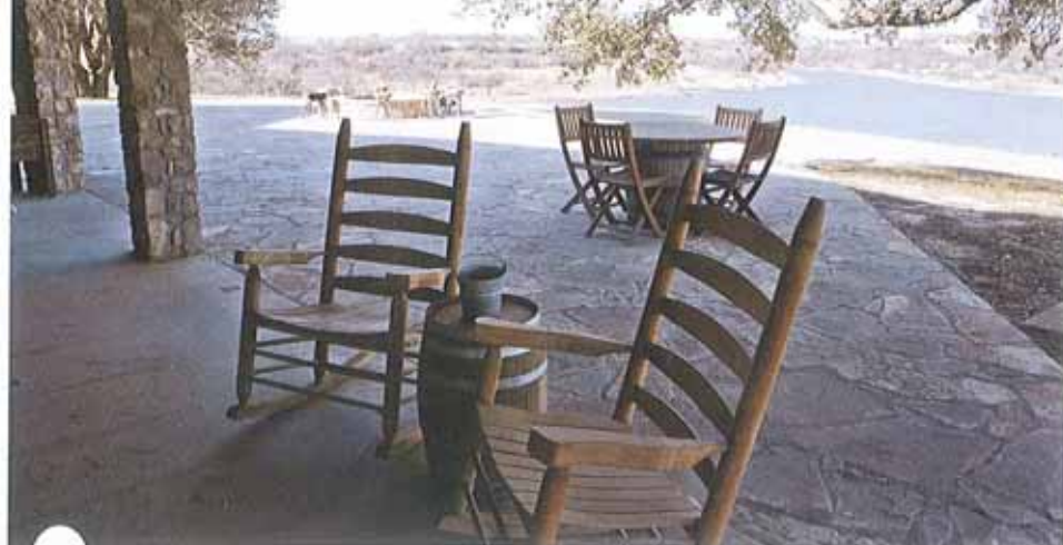
The outside porch view and conversation is best enjoyed in a rocking chair with a cigar and single malt.